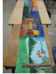
Art in Motion

Art Studio 2 has met their Marigold fourth grade buddies. They worked on a collaborative scratchboard project with a surreal theme as well visiting the Fall Prelude exhibit. Art Studio 2 is completing an art related job or artist interview. Students visited a job site or art studio (with a partner), interviewed the artist, took photos, and will create a power point for their final. There was a list of job sites for students to sign up to visit.