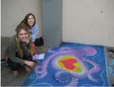
Pastels in the Quad